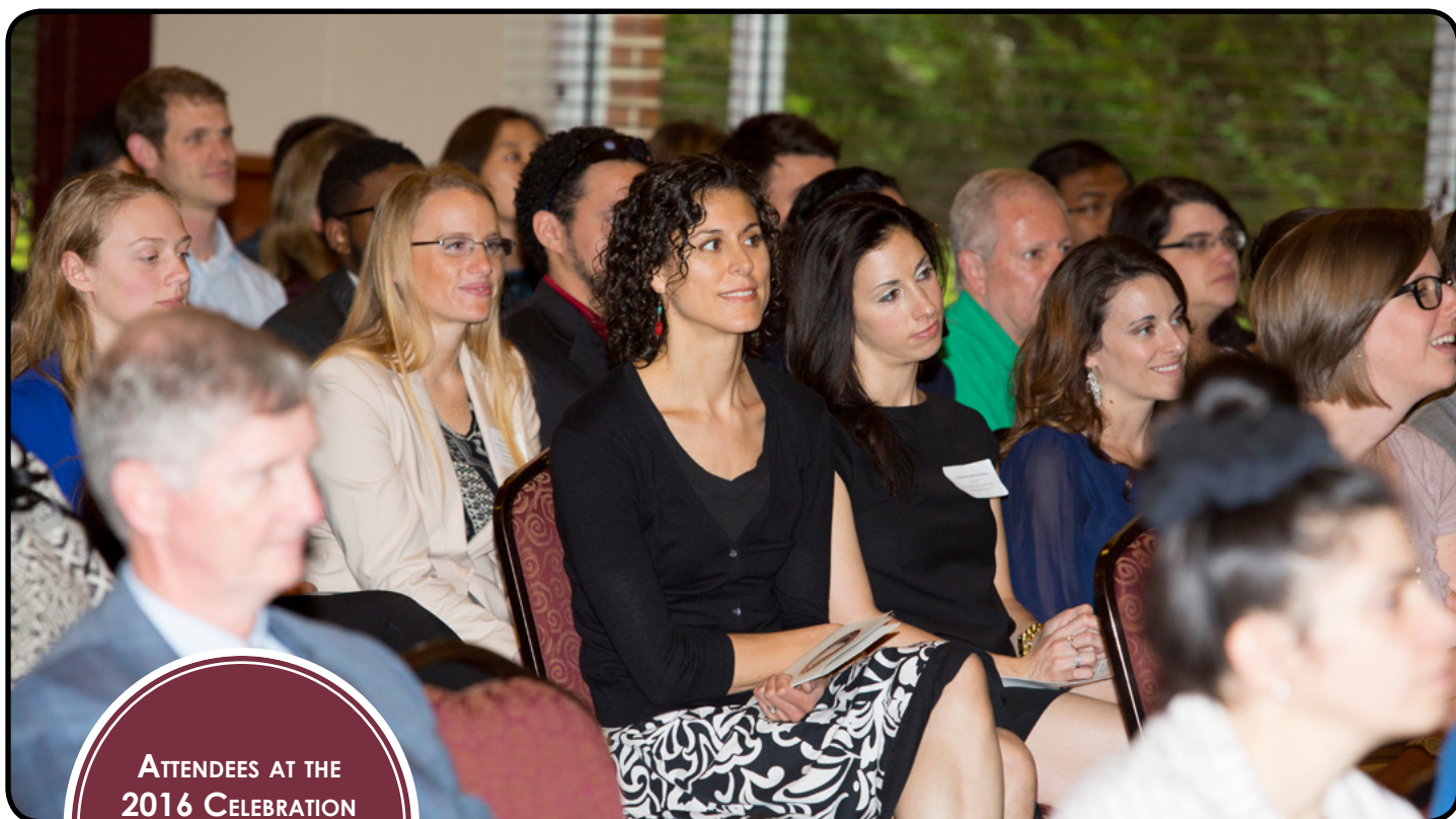
ATTENDEES AT THE 2016 CELEBRATION HELD AT ALUMNI CENTER