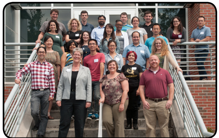
Group photo from Spring PDA event