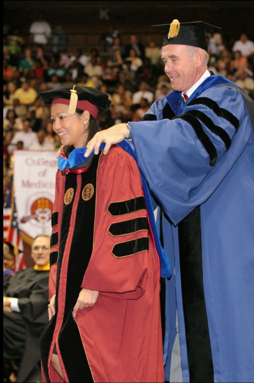
THE GRADUATE SCHOOL AT FSU

“Graduate study is a time of exploration and immersion in a particular specialty. It is a time for the free exchange of ideas, acquisition of new skills, and creation of new knowledge. It is a time when professors change from being your teachers to being mentors and colleagues.”