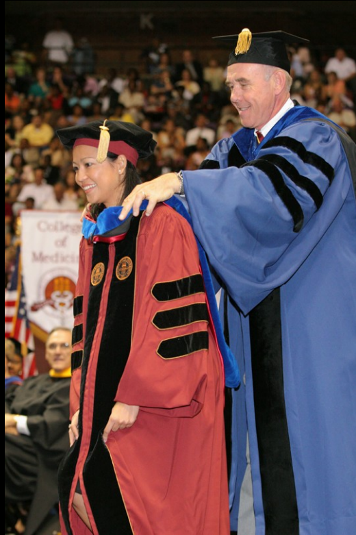
THE GRADUATE SCHOOL AT FSU

“Graduate study is a time of exploration and immersion in a particular specialty. It is a time for the free exchange of ideas, acquisition of new skills, and creation of new knowledge. It is a time when professors change from being your teachers to being mentors and colleagues.”