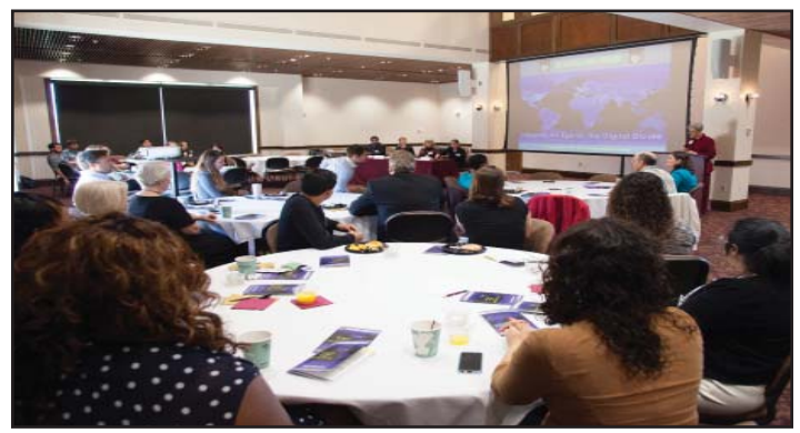
Addendees at the 2014 Fellows Forum

Digital Divide." From the ethics of MOOCs (Massive Open Online Courses) to sharing stories of obsessively checking E-mail, the discussions were at once lively and highly relevant to an audience of higher education faculty and graduate students.