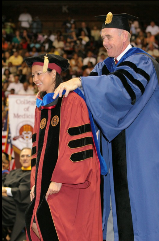
THE GRADUATE SCHOOL AT FSU

“Graduate study is a time of exploration and immersion in a particular specialty. It is a time for the free exchange of ideas, acquisition of new skills, and creation of new knowledge. It is a time when professors change from being your teachers to being mentors and colleagues.”